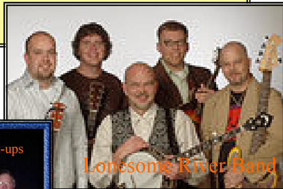
Lonesome River Band