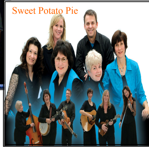
Sweet Potato Pie